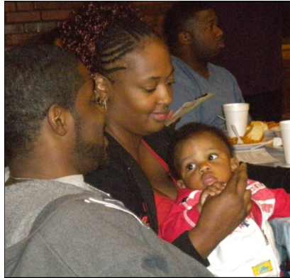
Even the youngest of the LAF family members attend the monthly Family Nights.