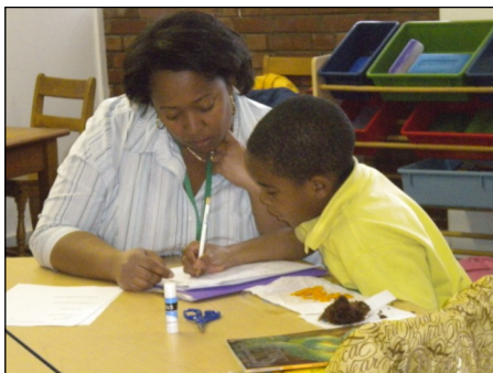
A little individual attention goes a long way.

Computers are a huge part of today's academic world and, at LAF, all of our students from kindergarten through high school had access to state of the art computers with specialized learning software each day after school this year. While the older students use the computers to access their teachers' websites, complete research projects, and write papers, the younger students enjoy playing academic games on the computers. In addition to making improvements to every computer, we were able to purchase four new children's computers for our K-2 nd grade students that includes a child-friendly web browser!