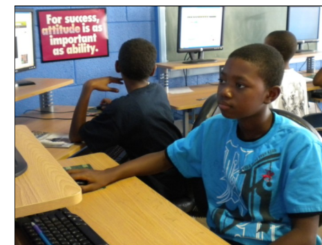
Each student had access to the internet each day after school.