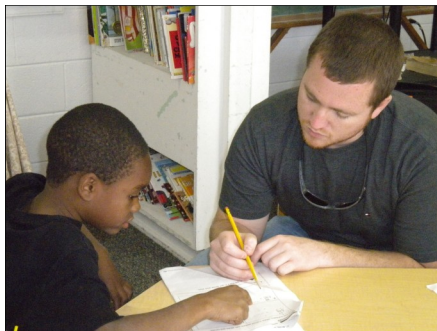
College students bring special energy to working with our students each day.

Our volunteers are truly a saving grace for us each day. Our wonderful volunteers and tutors allow us to provide more individualized attention to each of our students. They bring a variety of experiences and expertise and we are extremely grateful for them. The volunteers