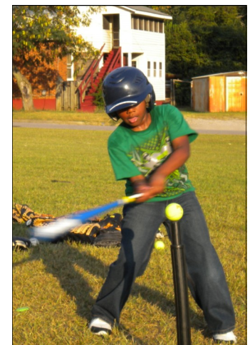
Sports are a big part of enrichment time for all LAF students.

The high school students participated in a pilot program at the Nature Research Center, a new wing at the Museum of Natural Sciences . They participated in a series of activities developed for the brand new wing.