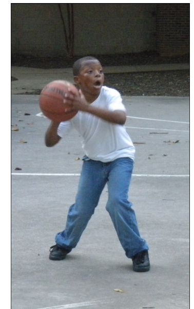
Get out and get up is the theme at Loaves and Fishes!

Camp Oak Hill Campus Outreach Capital Area Teen Court City of Raleigh Parks and Recreation Interfaith Food Shuttle Meredith College National Charity League National Council of Negro Women NC Museum of Natural Sciences NC State University Peace College Rock Fish Meadows Retreat Center Scott-Free SERA, Inc. Shaw University Step UP Ministries Triangle Aquatic Center YMCA of the Triangle Wake County Public Schools Wake Teen