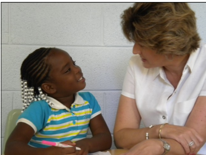
Wonderful volunteers helped our youngest students exceed academic expectations.

Our youngest students, the Eager Beavers , were our most impressive academic group this year. 90% of the students met their academic goals. Their secret? Hard work!